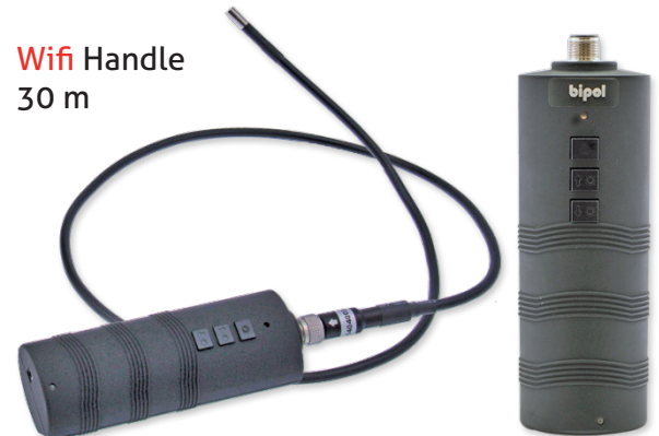
Wifi Handle 30 m