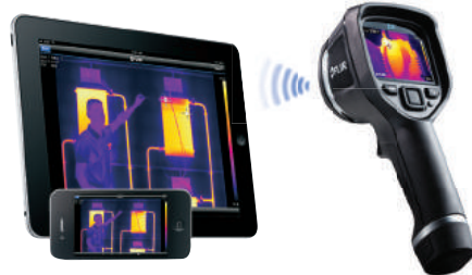
Wireless Connectivity to Smartphones, Tablets and more.