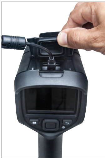
Download images fast via USB

Specifications are subject to change without notice. For the most up-to-date specifications, go to www.flir.com