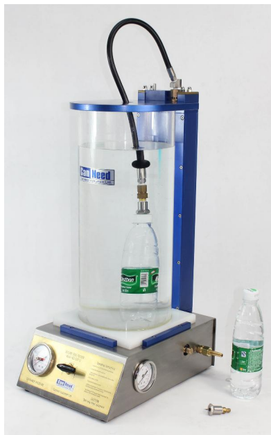
PET bottled beverage (Without gas)