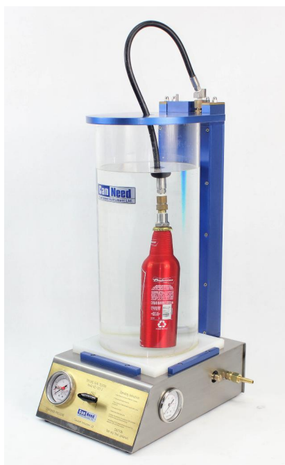
Bottle Can-crown cap