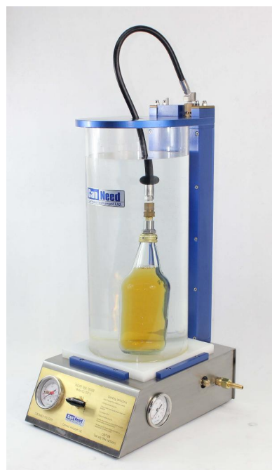
Glass bottle- metallic Screw cap