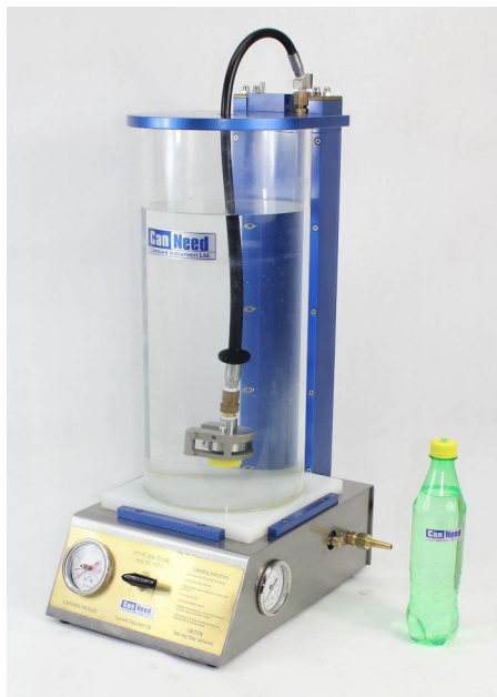
PET bottled beverage (With gas)