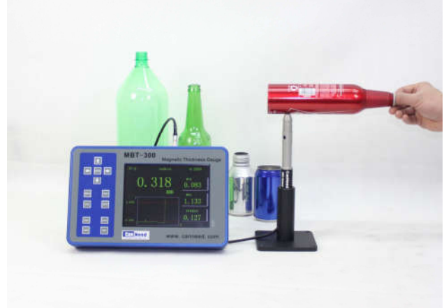
Aluminum Bottle Can Measuring