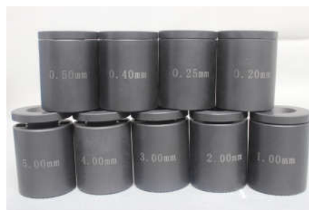
reference thickness calibration cell