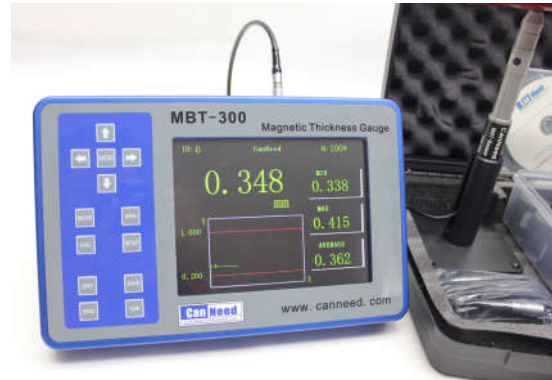
strip-graphic view of statistical data