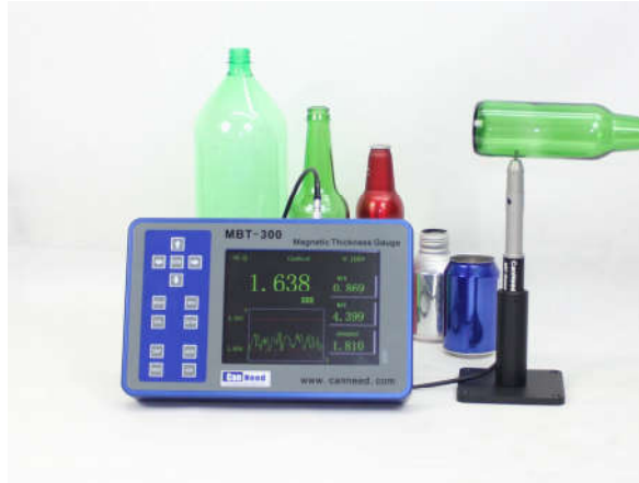
Glass Bottle Measuring