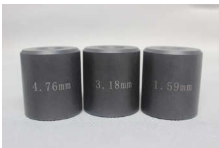
ball adjustment device