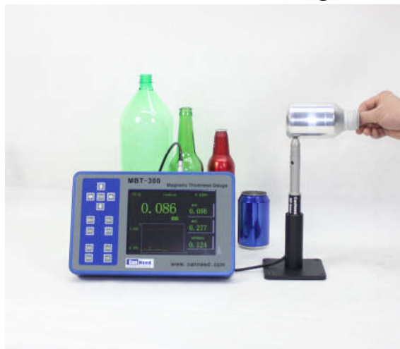
Aluminum Bottle Can Measuring