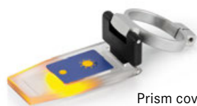
Prism coverplate with LED ORA-A1101