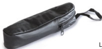
Leather bag ORA-A2103