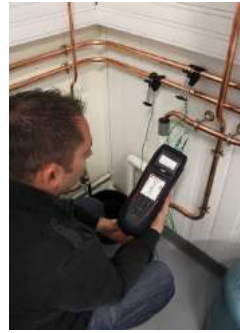
DHW network temperature