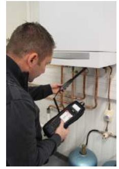
Ambient CO checking