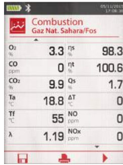
Example of analysis