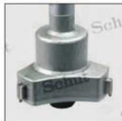
\varnothing 100 - 300 mm