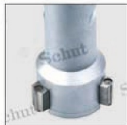
Measuring head (measuring range) \varnothing 3.5 - 50 mm