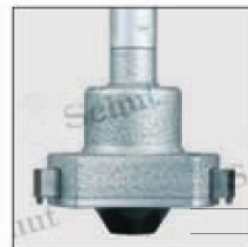
\varnothing 100 - 300 mm