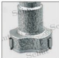
\varnothing 50 - 100 mm