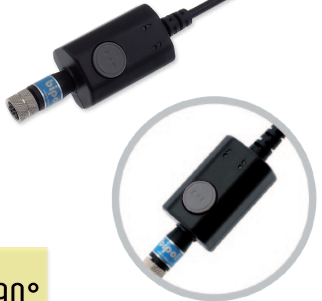
Button To change direction of vision from 0° to 90°

The Dual-V probes are compatible with all the videoscopes of our Bscope line