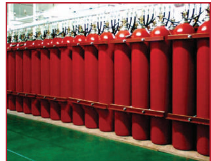
Typical application for the Portalevel Standard includes CO2 Cylinders (as pictured above) FM200, NOVEC, Halon and a variety of other similar cylinder types