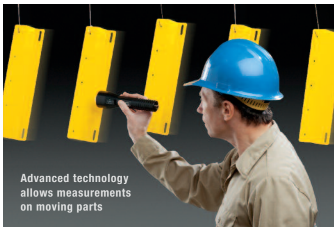
Advanced technology allows measurements on moving parts