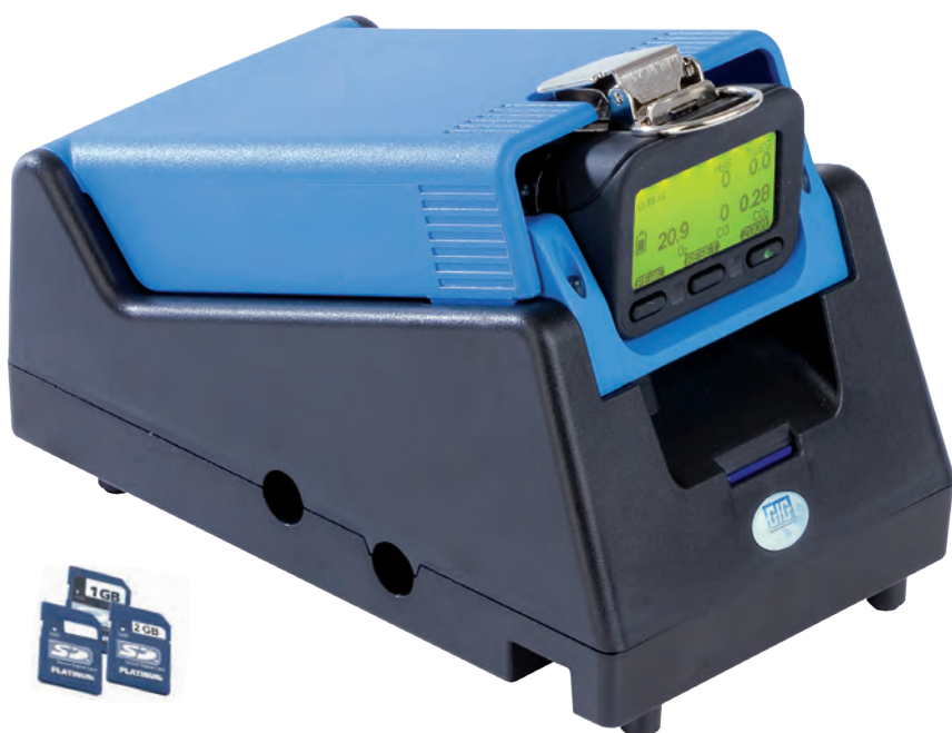
SD-cards: permanent data-logging for up to 45 years

The standard integrated memory records gas concentrations and alarms detected at a 1 minute interval for 30 hours. This storage capacity can be significantly increased by inserting an SD-memory card, which at a data-logging interval of 1 minute can store data for up to 45 years! Therefore, for the first time, a lifetime of worker's exposure data can be stored on one instrument.