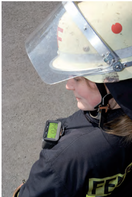
Reversible display always visible

tions, so working life and maintenance requirements are minimized. This gives the user far lower servicing and operating costs.