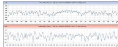
Roughness profile and primary profile