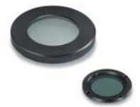
Simple polarising attachment